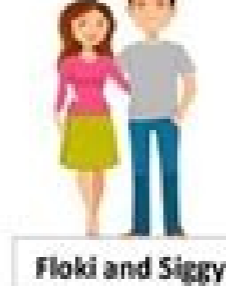
Floki and Siddy