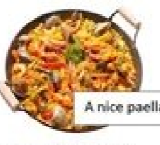
A nice paella